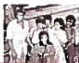
Homeless Jews arrive in search of a new life, Haifa, Palestine, July 21, 1947. [ enlarge ]