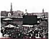
Pilgrims surround Kaaba, the holiest temple in Islam, at the center of the

Islam arose in the early seventh century C.E. in the settled desert community of Mecca (in present-day Saudi Arabia). It developed from both the Judeo-Christian tradition and the cultural values of the nomadic Bedouin tribes of Arabia.