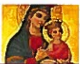
A Christian painting depicting Mary with the baby Jesus [ enlarge ]

Christianity developed out of the monotheistic tradition of Judaism; Jesus, its founder, was a member of the Jewish community in Roman Palestine. Its holy scriptures are the Old Testament (the Jewish Torah with additions), and the New Testament (written by the followers of Jesus after his death and containing the life story of Jesus and other early Christian writings).