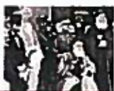
The establishment of Lebanon as an independent state is announced on the steps of a Maronite church, Lebanon, 1920. [ enlarge ]

The Coptic Church, the dominant form of Christianity in Egypt, arose from a doctrinal split in the Church at the Council of Chalcedon in 451. The Egyptian government supports the Copts' rights to worship and maintain their culture, but there has been some violence against the community by extremist Muslims.