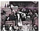
An artist's depiction of Christian Crusaders [ enlarge ]

Relationships between Jewish and Christian communities have often been difficult, particularly in Christian Europe. There, Jewish communities were often subject to discrimination and violence at the hands of Christians.